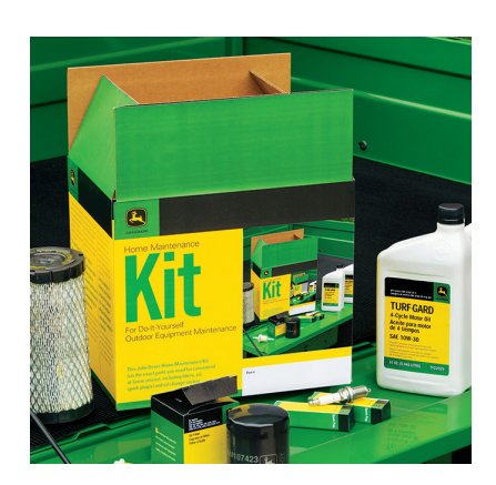
PARTS: Your John Deere dealer offers quality OEM Parts designed to maximize performance and reduce downtime.

There's no time for downtime when you need to be in the field. Count on your John Deere dealer for solutions and support and your Multi-Use Account for a dependable line of credit season after season.