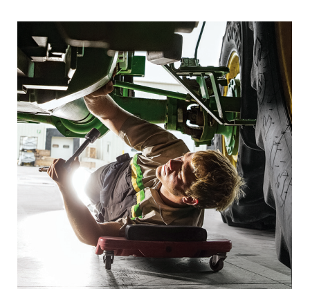
SERVICE: Pre- and post-season inspections keep your equipment running like new and catch small problems before they become costly repairs.