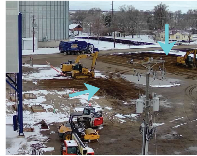
Belgrade agronomy campus. The arrows indicate where the agronomy office and mechanic’s shop used to sit.

As I highlight the above two projects, our mechanics have also been busy transitioning into a new shop (known as “The Barn”) adjacent to Belgrade Co-op’s existing properties that we purchased in December. That acquisition is what started this expansion and gave us the land and infrastructure we need to accommodate future growth without limitations as we move forward.