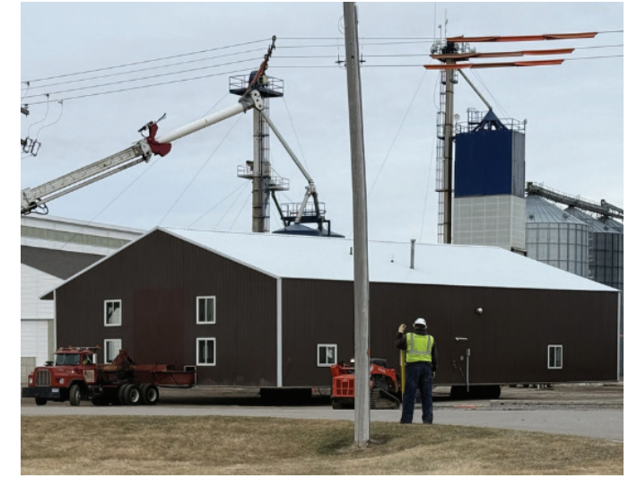
Our mechanic’s shop building was moved to the west side of the main office and is the future home of the Energy Shop.

Lastly, switching focus to an upcoming busy spring, your Co-op has the personnel and equipment in place ready to service your needs. Our board of directors approved field equipment purchases through our capital expenditure budget in preparation of navigating a busy season ahead and your team at Belgrade Co-op has finalized our “roster” of full-time and seasonal, part-time staff ready to continue the mission of exceeding your customer service expectations in 2026. With that, I would like to say “Thank You” to our members and customers for the business through the first half of 2026 and we look forward to servicing your needs through a successful 98 th year as a Cooperative.