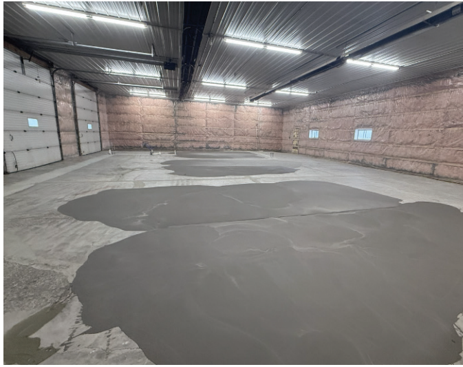
Main Office: What was previously the propane and fuel shop on the east end of the building is being converted to office space.