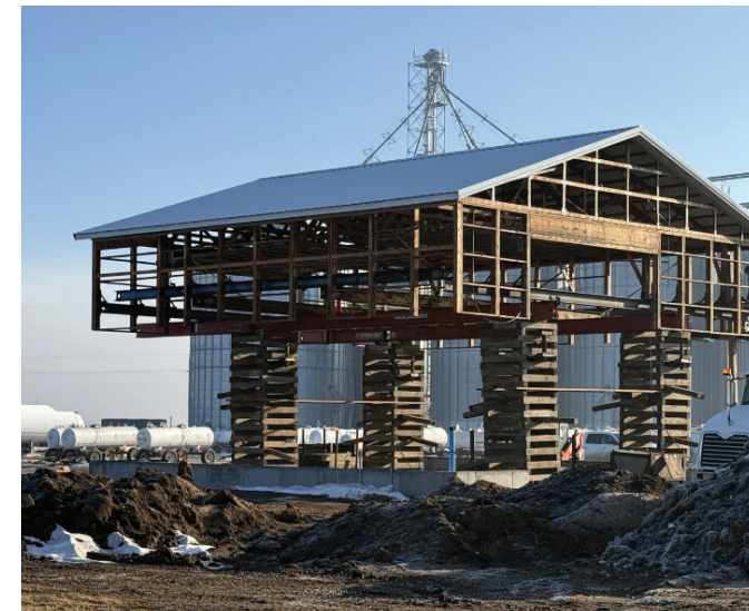
The NH 3 site just west of Belgrade saw some changes with the installation of a new rinse pad area for agronomy equipment.

Lastly, switching focus to an upcoming busy spring, your Co-op has the personnel and equipment in place ready to service your needs. Our board of directors approved field equipment purchases through our capital expenditure budget in preparation of navigating a busy season ahead and your team at Belgrade Co-op has finalized our “roster” of full-time and seasonal, part-time staff ready to continue the mission of exceeding your customer service expectations in 2026. With that, I would like to say “Thank You” to our members and customers for the business through the first half of 2026 and we look forward to servicing your needs through a successful 98 th year as a Cooperative.