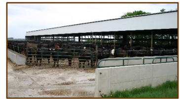
Ridge Roof Open Concrete Lot