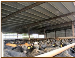
Mono Slope Barn