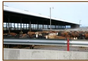
Ridge Roof Open Concrete Lot