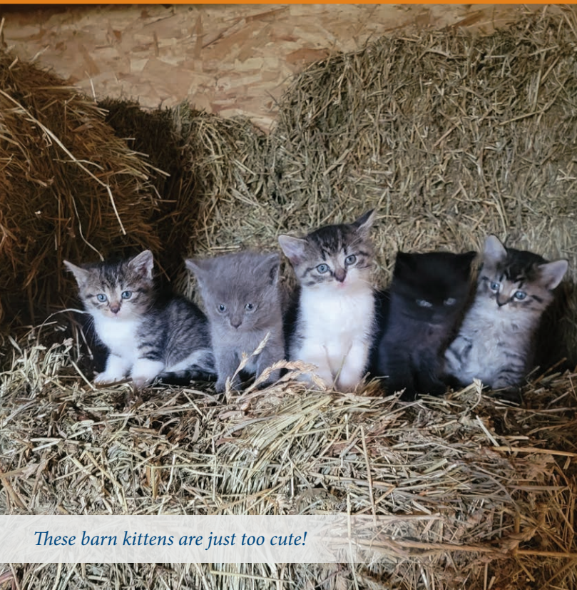
These barn kittens are just too cute!