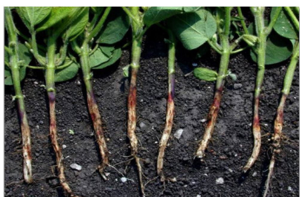
Rhizoctonia Root Rot