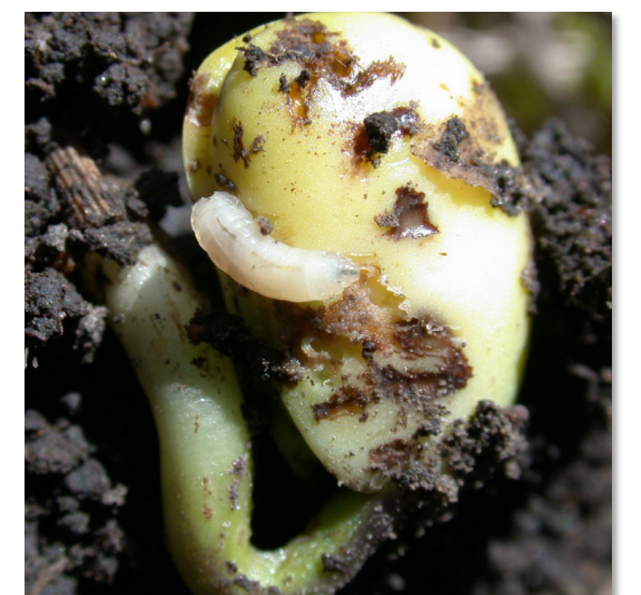
Seed Corn Maggot