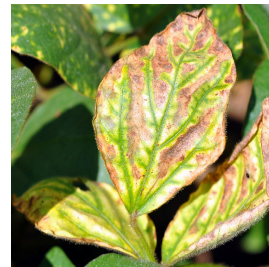
Sudden Death Syndrome