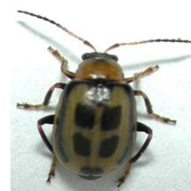
Bean Leaf Beetle