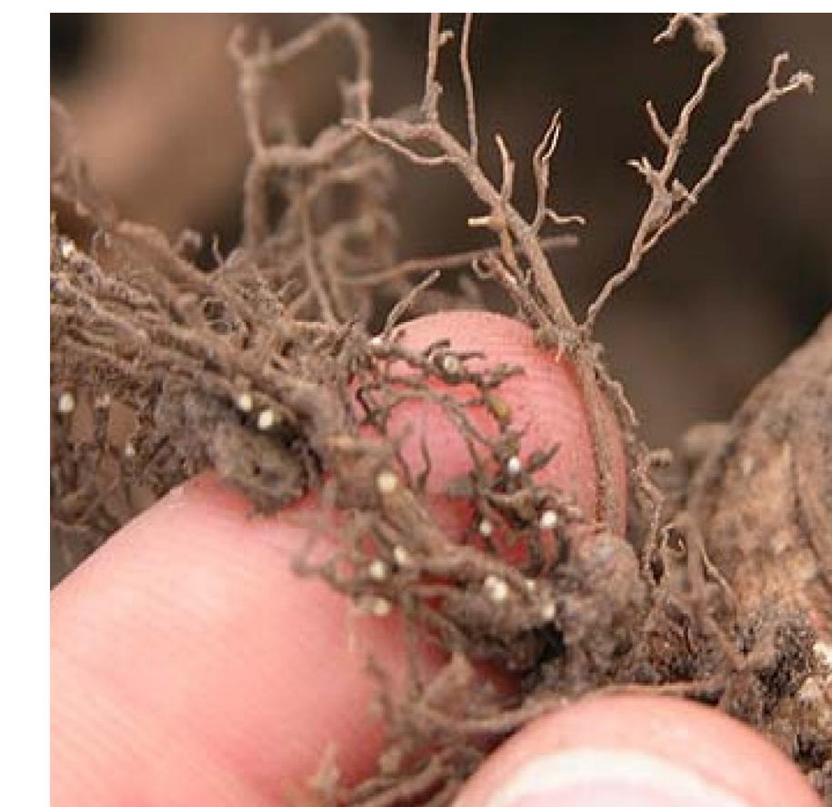
Soybean Cyst Nematodes