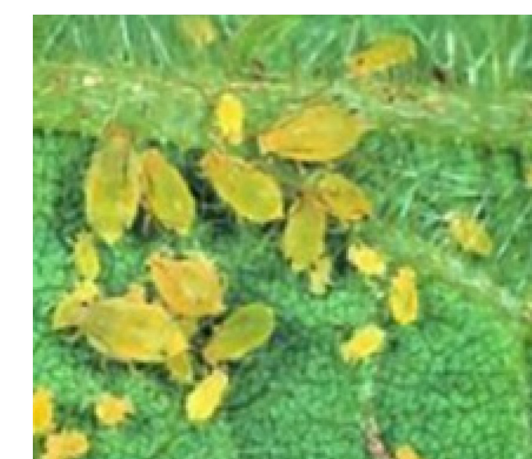
Early Season Soybean Aphid