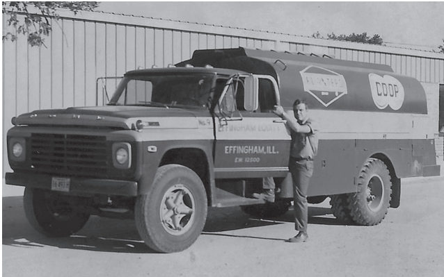
The Equity's Energy Division has a long history of providing quality products & service.